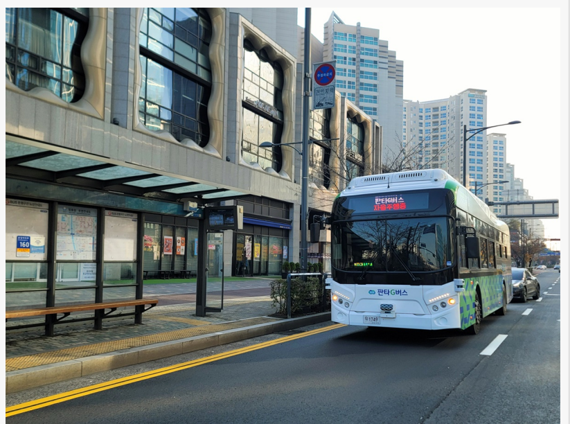
PanTa-G bus in service

Pangyo Techno Valley is recognized as a leading industrial cluster in South Korea, densely populated with prominent companies and institutions. It is considered one of the representative areas facing frequent traffic congestion during commuting hours, posing challenges for public transportation use. Additionally, accessibility and convenience of movement between the first Pangyo (located in Sampyeong-dong, Seongnam City) and the second Pangyo (including areas in Sihyeong-dong and Geumto-dong) remained obstacles.