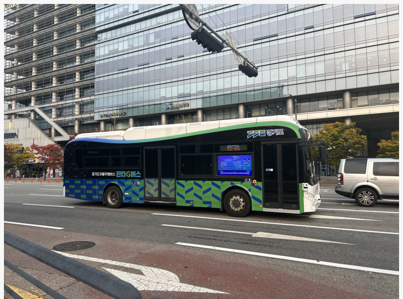
FantaG bus in operation in Pangyo Techno Valley

While the average daily passenger count for PanTa-G Bus was initially 74 in July, it increased to 136 in October, representing a growth of approximately 1.8 times.