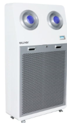
The Q Series Air Purifier