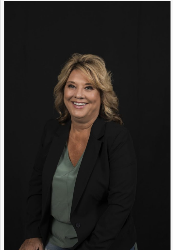
Clearwater probate lawyer