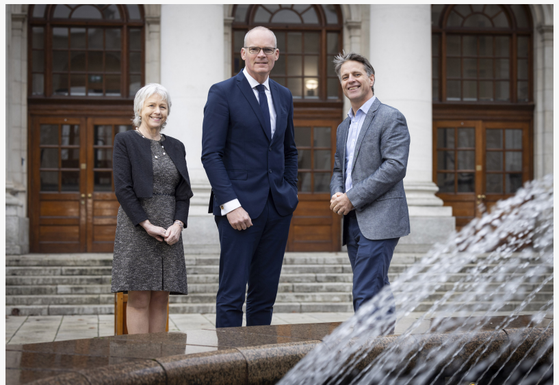
Minister for Enterprise, Trade and Employment Simon Coveney congratulates Payemoji on Enterprise Ireland Investment.