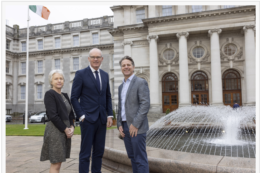
Minister for Enterprise, Trade and Employment Simon Coveney TD. The investment secured is a testament to the innovation and dedication of the Payemoji team

an innovator in the conversational commerce market and can help businesses scale by engaging more customers through messaging apps. Enterprise Ireland is proud to join Payemoji on their journey of becoming a major provider of conversational commerce solutions in international markets. We would like to congratulate the Payemoji team on their significant achievements to date and we look forward to playing a role in their continued success as they expand into new markets.”