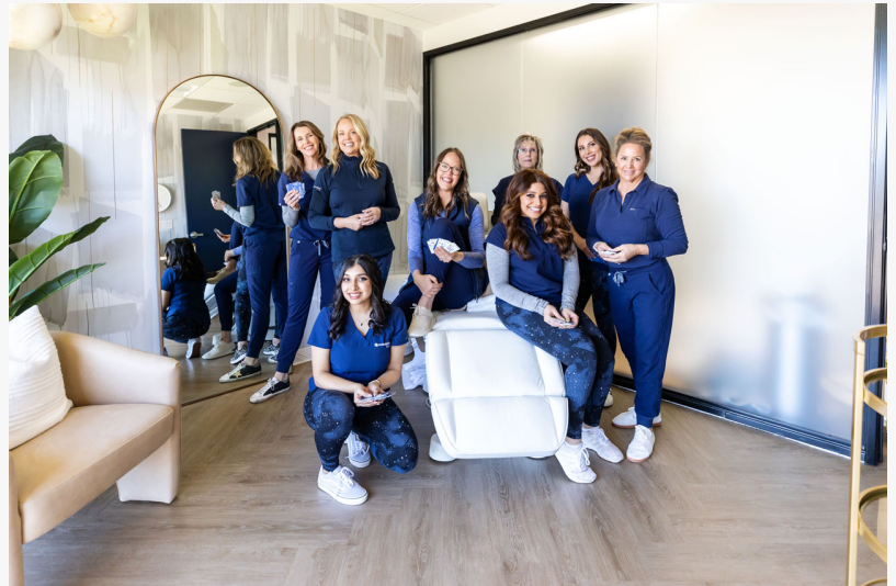
Bodify Announces Morpheus8 Anti-Aging Treatment at its Phoenix Location