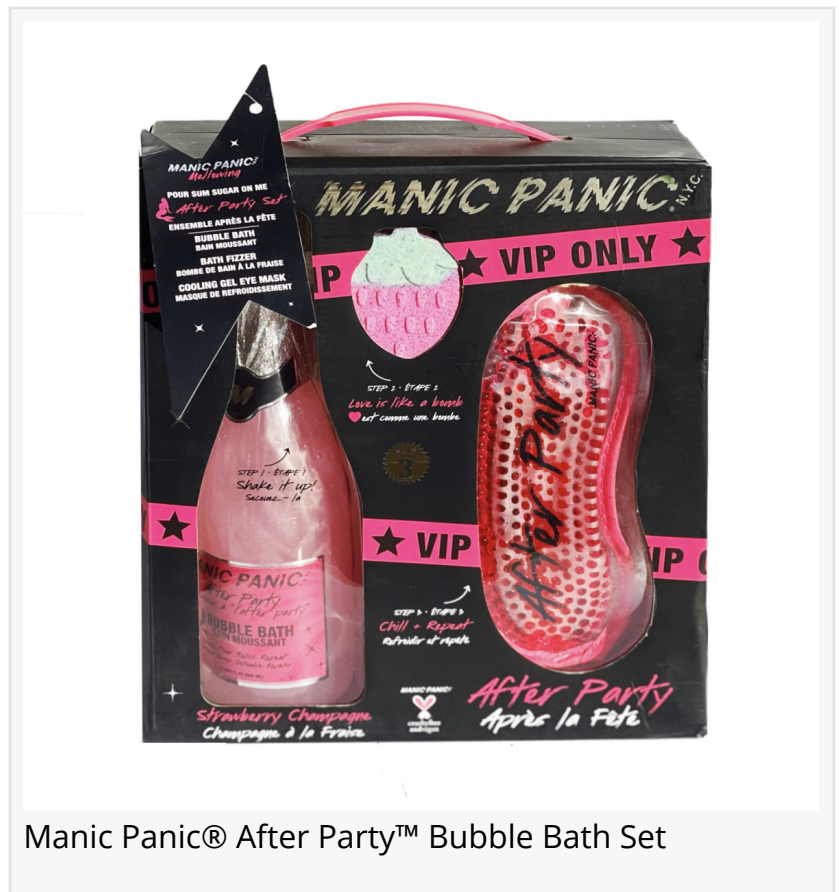
Manic Panic® After Party™ Bubble Bath Set

With its eye-catching packaging, high-quality products, colorful and fragrant bath bombs, bath salts, body oil, body wash, hand creams, and cooling eye masks- this celebratory collection is sure to be a hit among beauty enthusiasts.