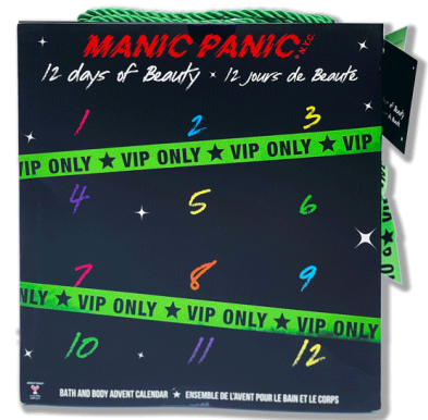
12 Days of Manic Panic® Beauty Bath and Body Advent Calendar

This press release can be viewed online at: https://www.einpresswire.com/article/671500333