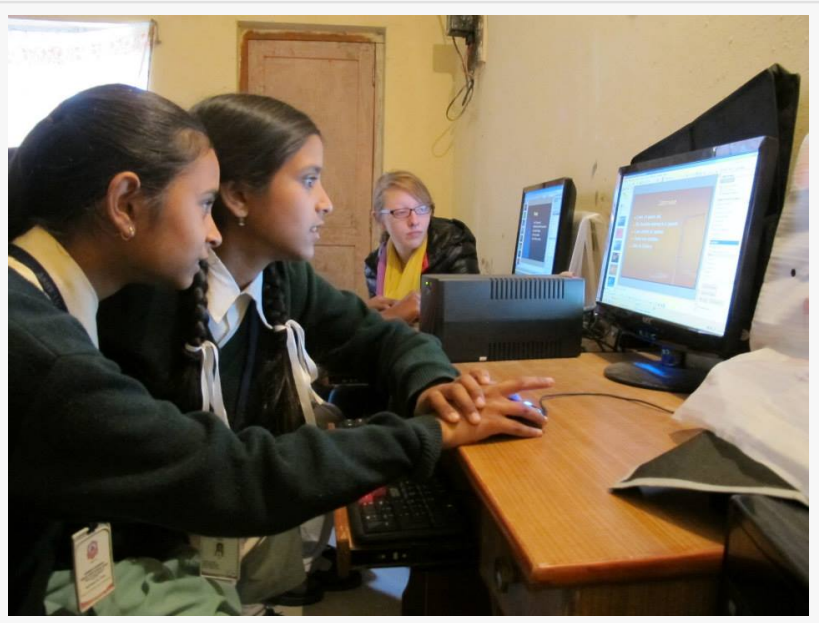
Volunteer Programs India iSpiice

To learn more about iSpiice Volunteer programs please visit: