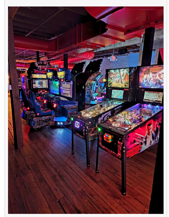
Pinball Arcade Games at B Social by Brick & Bourbon