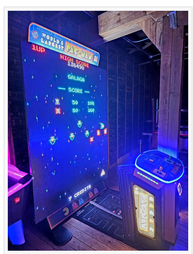
Arcade Pacman at B Social by Brick & Bourbon

B Social by Brick & Bourbon in St Cloud, Minnesota, offers a unique dual-experience with an upstairs