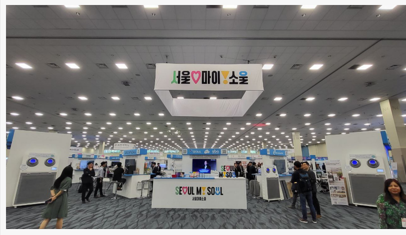
World Korean Business Convention

In its pursuit to solidify its position as a leader in the domestic market and expand globally, See-Through Tech, with a substantial market share and a robust network of partners, including dental labs and investors, conducted market research and explored opportunities, especially in the U.S. market.