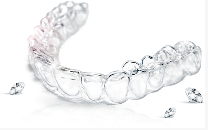
See-Through Smart Orthodontic Aligner