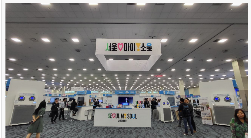
World Korean Business Convention