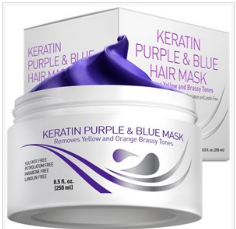
Vitamins Keratin Purple Hair Mask

Customers are encouraged to visit the Vitamins Hair Cosmetics Amazon Store for more information and to make their purchases. This is a chance not to be missed for those seeking to elevate their hair care experience with Vitamins' advanced solutions.