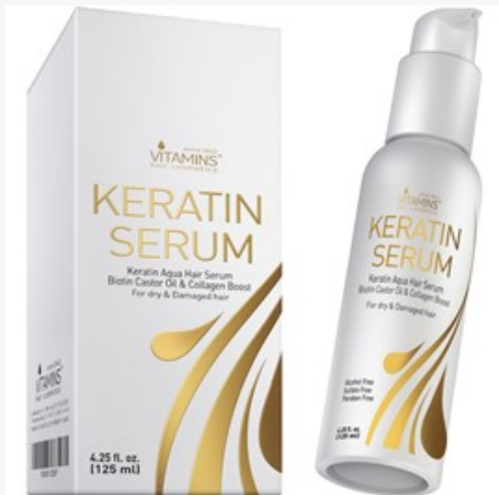
Keratin Hair Serum