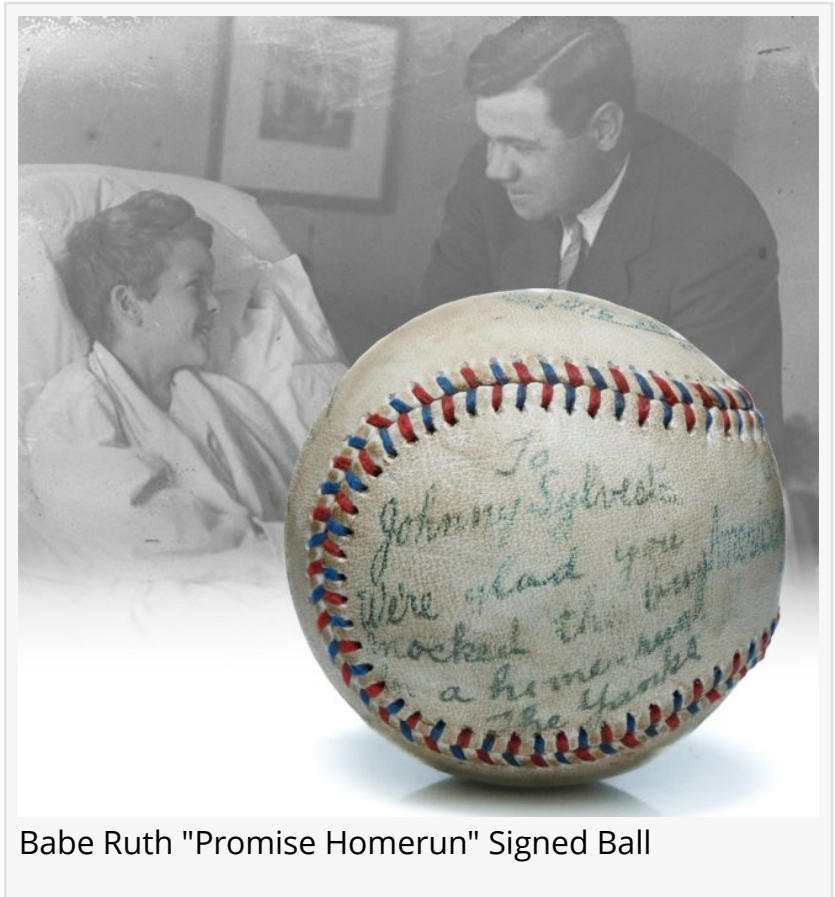
Babe Ruth "Promise Homerun" Signed Ball