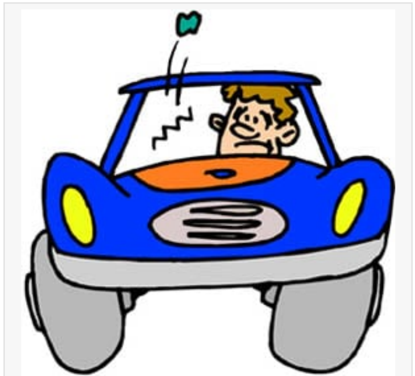
Auto Glass Repair

In conclusion, addressing rock chips in windshields promptly is crucial for vehicle safety and