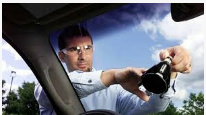
Windshield Repair Houston

Windshield Repair, a trusted name in auto glass services, is sharing valuable insights on how to prevent the spread of rock chips in windshields . Rock chips in windshields can be a common issue, and addressing them promptly is essential for vehicle safety and appearance.