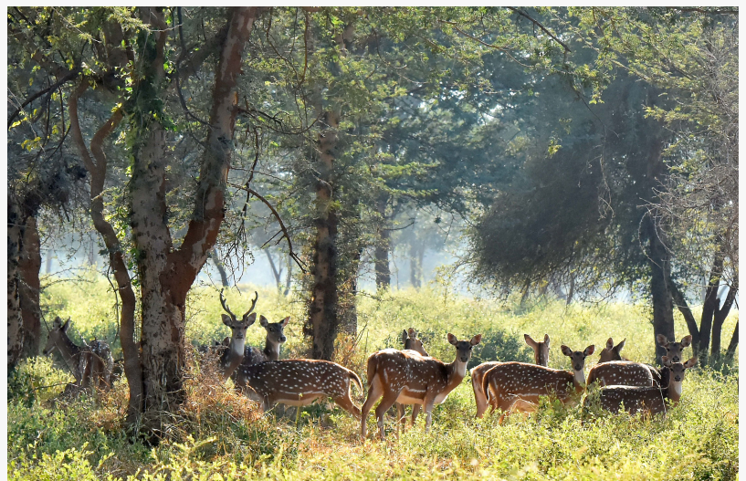
A herd of Chital commonly known as spotted deer