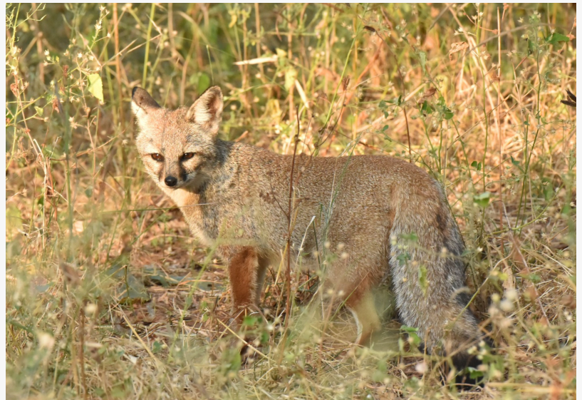
Fox Sighting at the Kuno National Park

Explore wildlife in their own open domain with guided safaris. Spot leopards, deer, blue bucks,