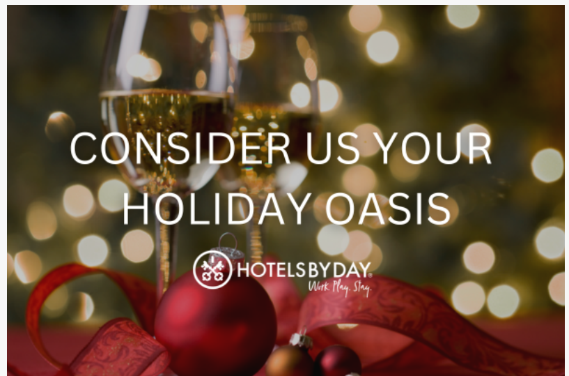
Holiday Oasis Daycation Giveaway

/EINPresswire.com/ -- As the holiday season wraps the world in its festive embrace, it also brings a flurry of activities that can be overwhelming. In a delightful response, HotelsByDay announces the 'Holiday Oasis' giveaway. This engaging initiative aims to sprinkle some extra joy during this bustling time, offering three lucky participants a chance to win a $150 daycation at one of the many partner hotels.