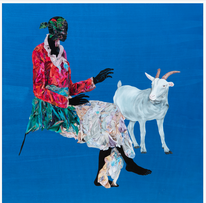
Vitshois Mwilambwe Bondo La reine Rwej, 2019 Acrylic and collage on linen 74.8 x 74.8 inches (190 x 190 cm)

Garden of Humanity (on view Dec 3 - June 30)