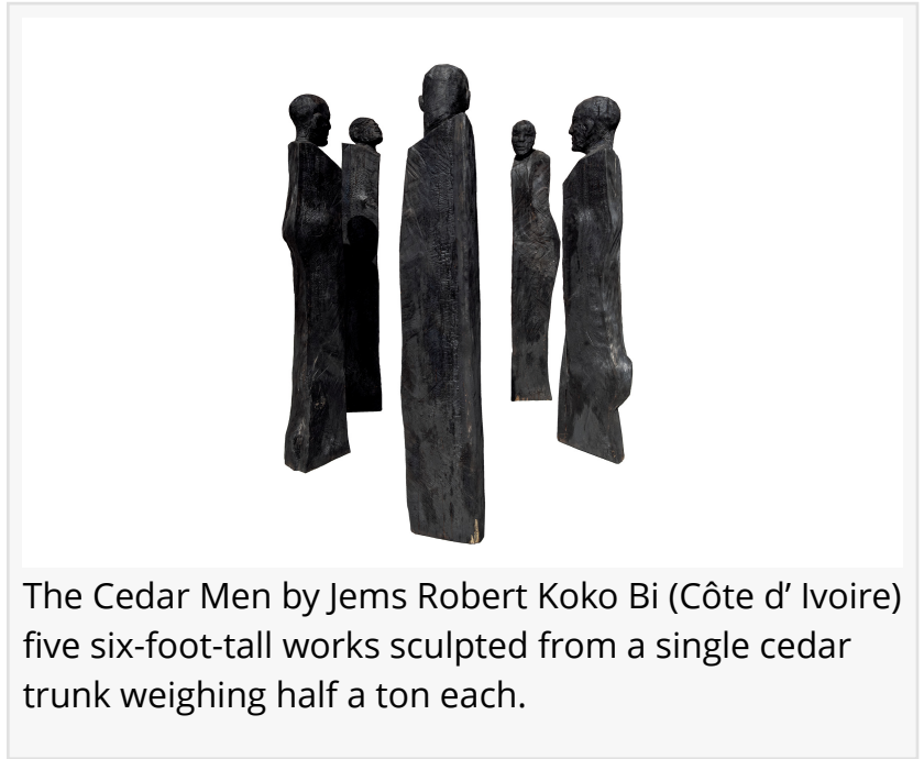
The Cedar Men by Jems Robert Koko Bi (Côte d' Ivoire) five six-foot-tall works sculpted from a single cedar trunk weighing half a ton each.

EINPresswire.com/ -- Ten North Group is pleased to announce Art of Transformation : AFRICA GLOBAL, the 2023 conceptual framework exhibiting the diversity of African Diasporic communities and their varied experiences, taking place during Art Basel Miami Beach 2023 and Miami Art Week 2023. This annual program is designed to explore issues in African and African Diaspora contemporary art and brings artists of African descent from around the world to Miami in a series of exhibitions, panel discussions, performances and film screenings. Ten North Group presents AFRICA GLOBAL in Opa-locka, FL, from December 2 through December 10, 2023.