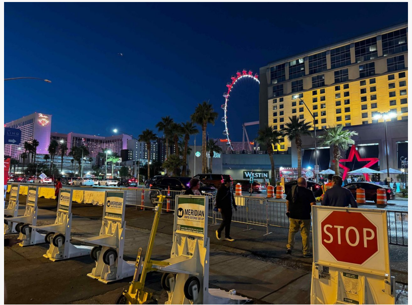
Las Vegas Grand Prix 2023

Meridian, with its Archer mobile barriers and beam gates, guarded the major entry points for the race fans, visiting celebrities, race teams and officials.