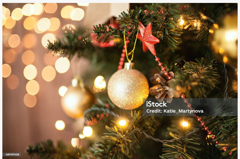
Deck the Halls

Historic Garden District Announces the 48th Annual Holiday Home Tours