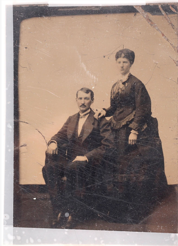
Rare tintype photo of John Henry Holliday, better known as Doc Holliday, along with his longtime companion Kate Horony, better known as "Big Nose Kate" (est. $7,000-$15,000).