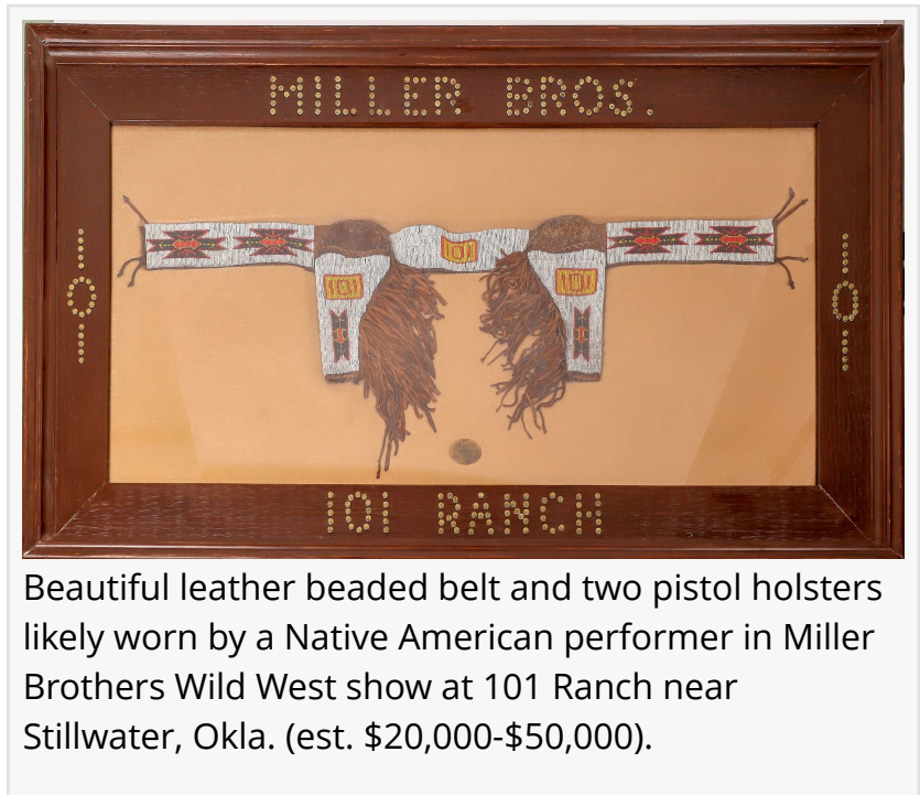
Beautiful leather beaded belt and two pistol holsters likely worn by a Native American performer in Miller Brothers Wild West show at 101 Ranch near Stillwater, Okla. (est. $20,000-$50,000).

RENO, NV, UNITED STATES, November 30, 2023 /EINPresswire.com/ -- Holabird Western Americana Collections, LLC is saving the best for last in 2023 as it gears up for what is expected to be their biggest sale of the year – a Christmas Chronicles auction , a four-day mega-event packed with over 2,500 lots in a variety of collecting categories , online and live in the Reno gallery at 3555 Airway Drive, starting at 8 am Pacific time each day.