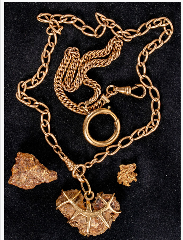
Gold necklace with a gold nugget engraved in gold, "George's Gulch 1909"; 8.3-gram and 1.7-gram gold nuggets with quartz; and a 12.2-gram gold watch chain (est. $5,000-$9,000).

A famous stock certificate from 1915 of the Great Cariboo Mining Company (Yukon Territory, Canada), with vignettes of gold nuggets and two vails of gold, plus placer mining scenes and underground mining scenes, 13 inches by 15 inches, has an estimate of $800-$1,200. Also, a Wells Fargo & Co. Express reverse glass framed commemorative mirror, probably made for collectors, possibly in the 1960s, 18 inches by 24 ¾ inches (framed) should bring $500-$1,000.