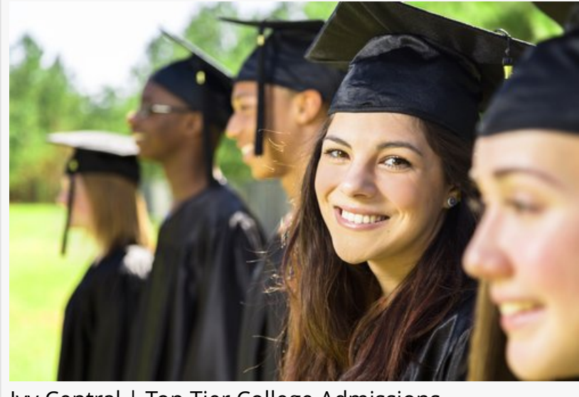
Ivy Central | Top Tier College Admissions