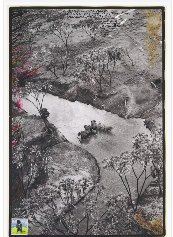
Peter Beard, American, A BEND IN THE RIVER AFTER THE DIE-OFF, 1976