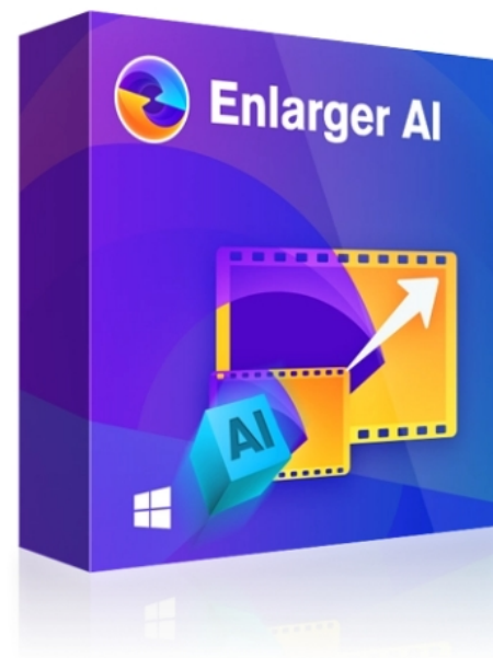
unifab video enlarger ai

UniFab Video Enlarger AI is incredibly user-friendly for beginners who want professional results. There is no need for AI knowledge or complex settings. In addition, its AI model can