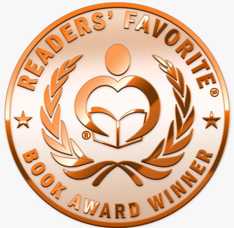
Readers' Favorite 2023 International Book Awards medal