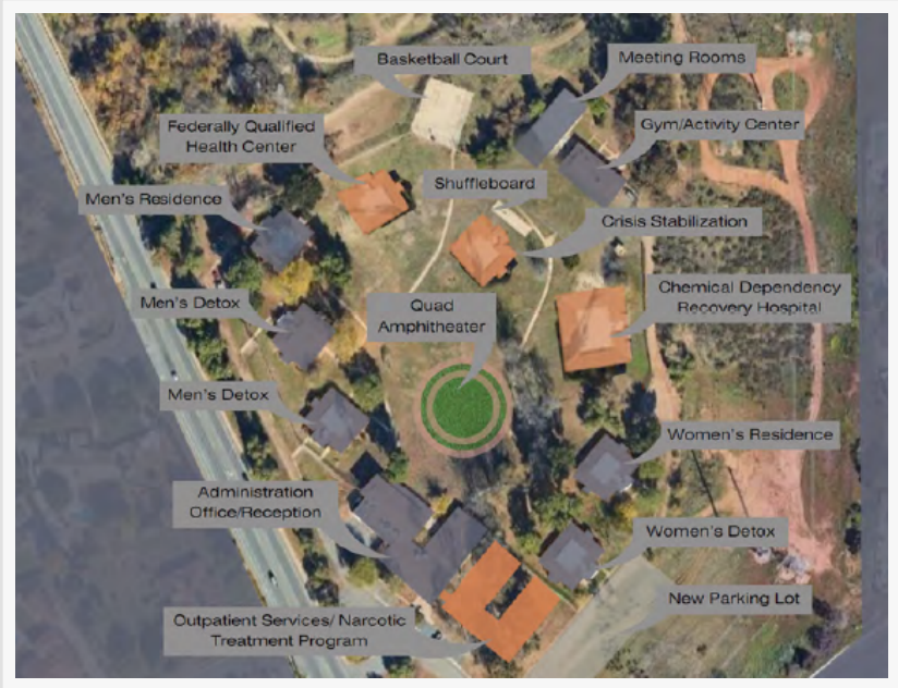
New Hope by Providing Comprehensive Treatment Leaving Now Individual Behind.

The Behavioral Health Facility expects to open as a 110-bed residential withdrawal management and treatment center for both men and women. Depending upon how quickly we can get construction completed,