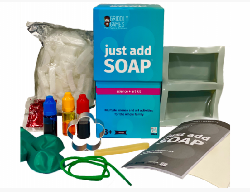
Just Add Soap (contents) from Griddly Games

New Just Add Soap science + activity kit from Griddly Games