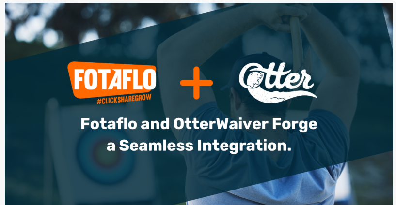
Fotaflo and OtterWaiver Forge a Seamless Integration.

Fotaflo and Otterwaiver unite to transform precision into an art in axe throwing and shooting ranges. This strategic partnership aims to seamlessly integrate photo memories with digital waivers, promising an immersive experience for every adventurer.