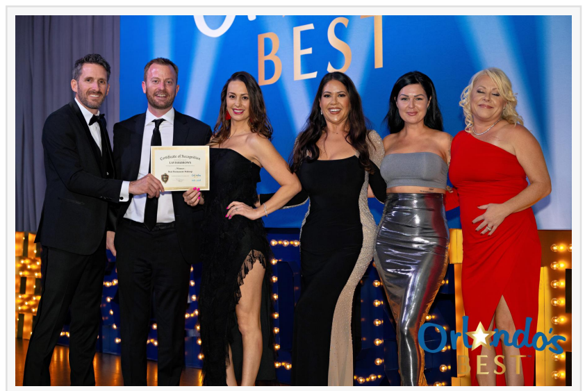
LAVISHiBROWS Winter Garden Orlando's Best Permanent Makeup 2023

Having served Winter Garden and surrounding communities for an impressive seven years, LAVISHiBROWS has solidified its position as the premier provider of microblading, permanent makeup, plasma fibroblast, microneedling, advanced custom facials, VI Peel, PRX Derm Perfexion,