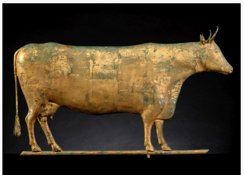
Cushing & White copper weathervane depicting full-bodied dairy cow with gilt finish. Estimate: $3,000-$5,000

A great variety is represented in the sale, with discoveries to be made at all price points, such as: a 19th-century joined-wood ship's figurehead depicting a helmeted soldier with helmet and