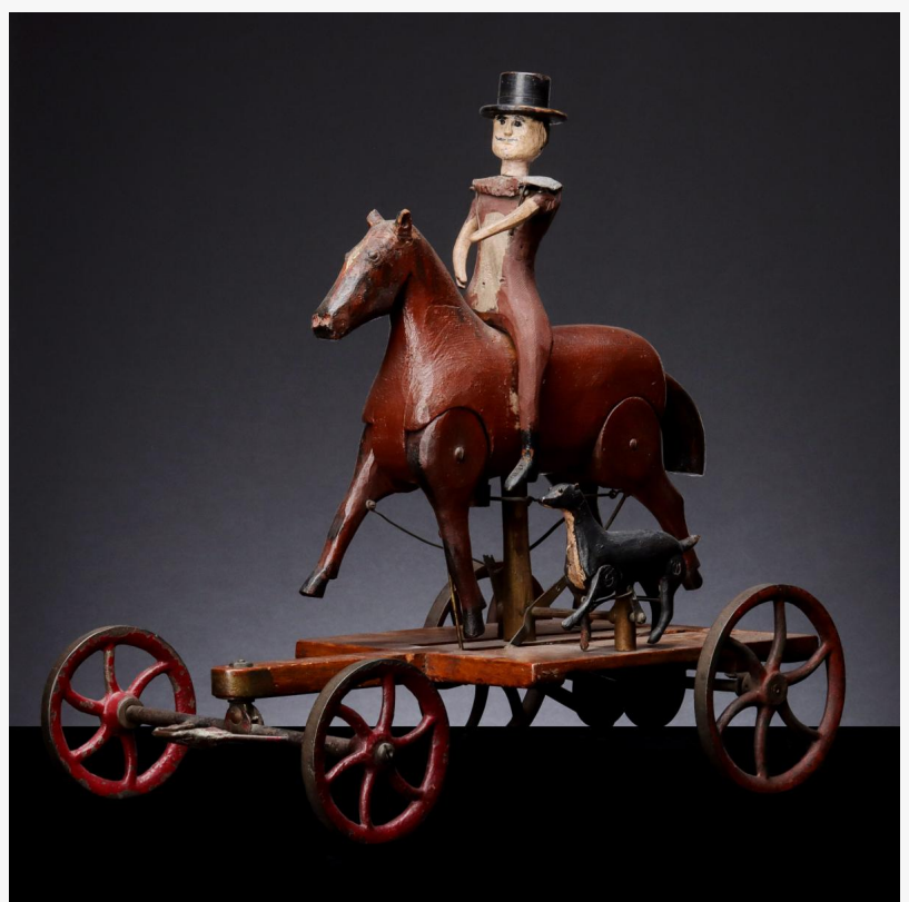
Folk art pull toy depicting animated top-hatted man riding articulated horse with articulated dog running alongside them. Estimate: $2,000-$4,000