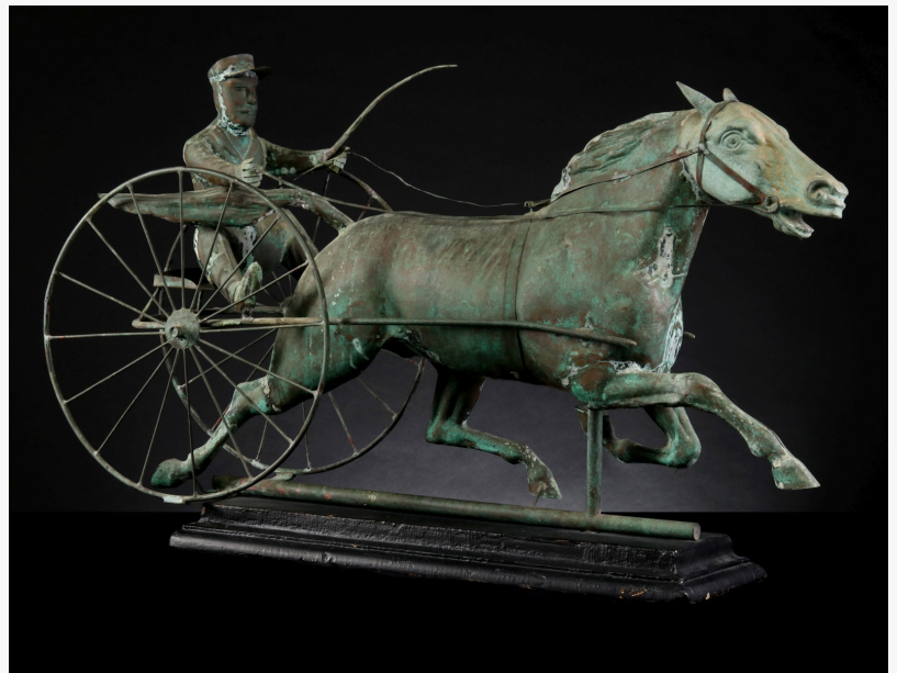
J W Fiske (attrib.) copper weathervane depicting legendary harness-racing horse St. Julien, King of Trotters. Estimate: $15,000-$20,000

The most unusual target is essentially a 49-inch-tall naïve artwork on sheet metal that depicts a lady lion tamer standing face to face with a rampant lion. Made circa 1890, the impressive oversize target is probably of English or Continental European origin and has a clever mechanical