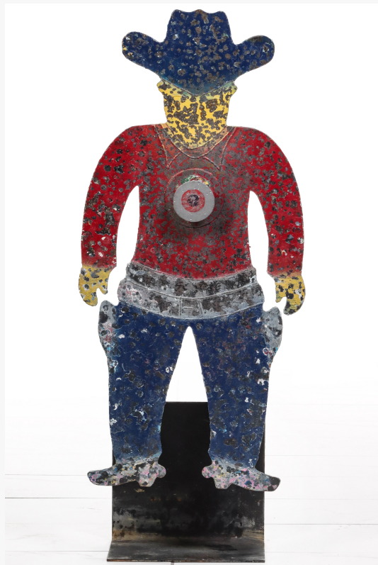
Scarce 1930s sheet-iron shooting gallery target depicting cowboy gunfighter. Estimate: $6,000-$9,000