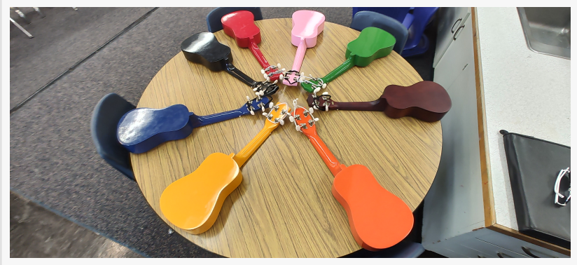
Ukuleles schools are gifted when the implement the program

embracing social-emotional development. And unlike traditional music education that focuses on teaching music for music's sake, Guitars and Ukes in the Classroom offers a unique developmental approach that makes music accessible to all learners as a vibrant part of learning every day. This includes serving students who have not previously been able to access musical learning due to isolation in special day