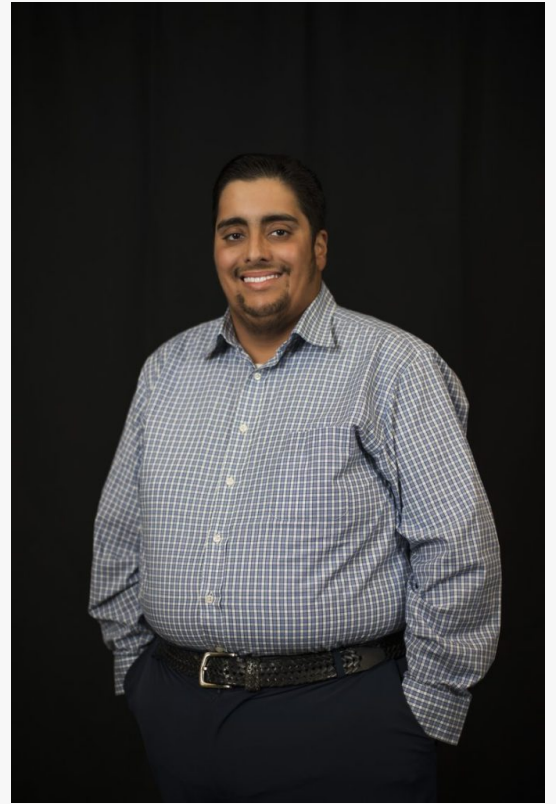
Tampa family law firm

This press release can be viewed online at: https://www.einpresswire.com/article/672368657