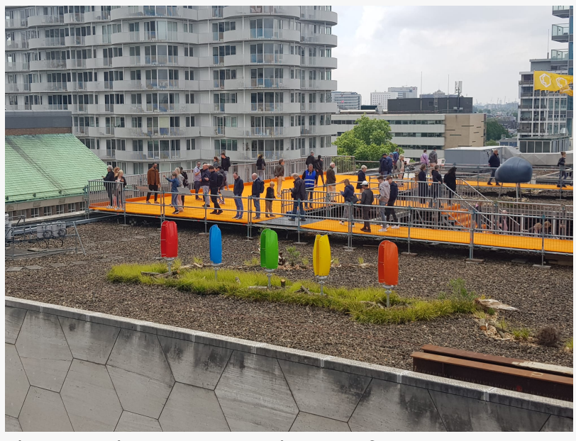
Flower Turbines at Rotterdam Roof Days

environments. It combines aerodynamic and electronic innovations with beautiful design, low noise, and bird friendliness. Unlike other turbines, they make each other perform better when tightly packed together.