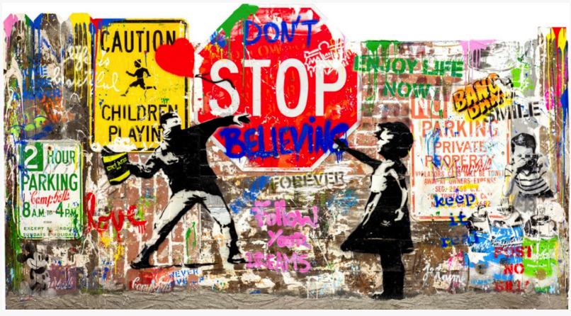
Mr. Brainwash - "Pop Wall", 2023

Mr. Brainwash - "Life Is Beautiful", 2023