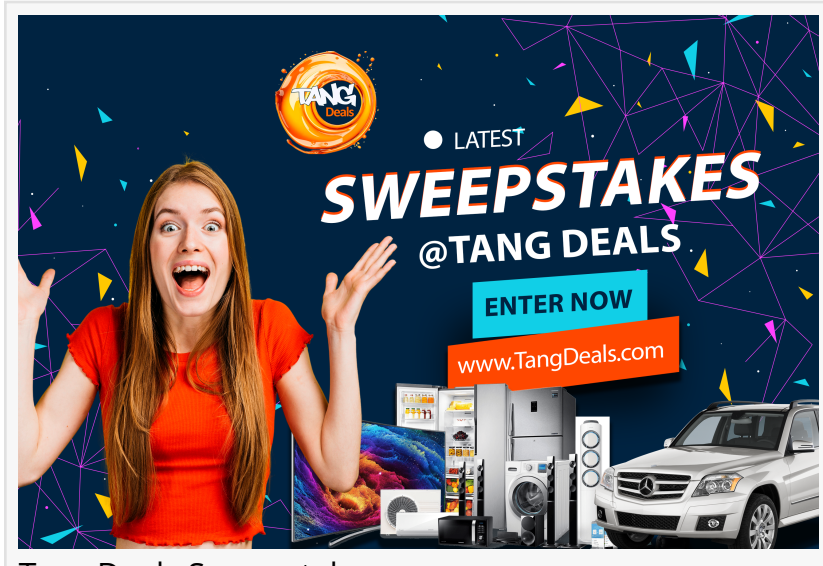
Tang Deals Sweepstakes

Each sweepstake has specific entry requirements. Carefully reviewing these guidelines ensures eligibility and avoids disqualification.