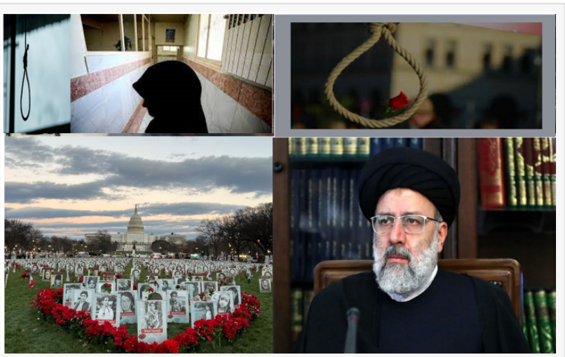
The mullahs' regime has maintained its power through killings. It sees its survival in the death of people in Iran and in the region. This regime has never had the will of responding to the needs of the Iranian people. It tortures and executes to stay alive.

PARIS, FARANCE, December 4, 2023 /EINPresswire.com/ -- The <u>National</u> <u>Council of Resistance of Iran-(NCRI)</u> Foreign Affairs Committee in an article stated that throughout its history, the mullahs' regime has maintained its power through killings. It sees its survival in the death of people in Iran and in the Middle East region. This outdated regime has never had the will nor the intention of responding to the needs of the Iranian people. It tortures and executes to stay alive.