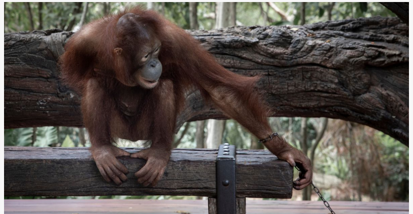
Orangutan chained at Thai Zoo

Lady Freethinker is also launching a petition urging Thailand to end this cruelty to orangutans and is urging the public to never visit any facility that exploits orangutans or any animal for profit and “entertainment.”