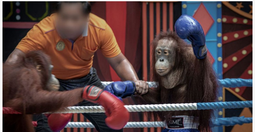
Orangutans forced to box

-- A new investigation from animal protection nonprofit Lady Freethinker (LFT) , in partnership with renowned photojournalist Aaron Gekoski, reveals shocking conditions for orangutans at Thai zoos, including the animals biting and clinging to the metal cage bars of their small enclosures, eating trash, and being forced to perform in "orangutan boxing" matches and other shows.