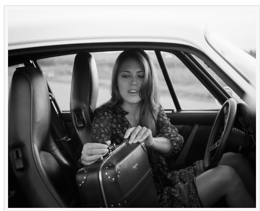
Hagent N°1 - Black calf leather handcrafted backpack

High demand, coupled with Hagent's commitment to slow luxury has quickly forced the brand to implement a waiting list, establishing Hagent as an exclusive backpack brand. This move is