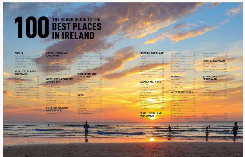
Inside The Rough Guide to the 100 Best Places in Ireland