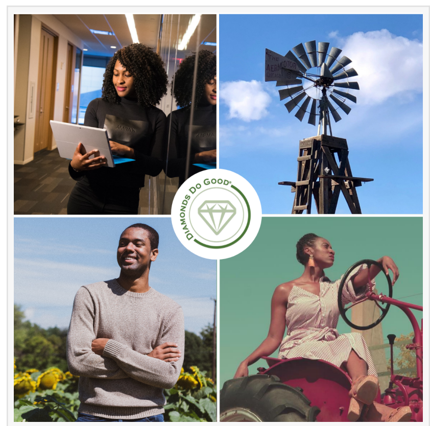
Diamonds Do Good® Entrepreneurship Grant - Launch image

GENEVA, SWITZERLAND, January 18, 2024 /EINPresswire.com/ -- UPG Biashara is an initiative that supports entrepreneurs in their journey to turn ideas into businesses. The unique ecosystem is built with a view that entrepreneurs make the world a better place and so they deserve support that maximises their chances of success. And this support is provided for free to 500 motivated entrepreneurs who earn their place by demonstrating their ideas and their passion. Sierra Leone is on a shortlist of priority countries thanks to the Diamonds Do Good® Entrepreneurship Grant and this