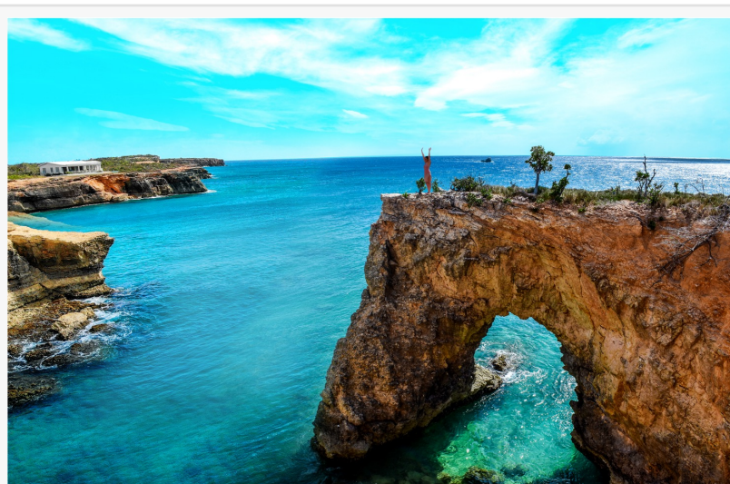
The Arch, West End, Anguilla

For travelers from the New York metro area, the Aurora Anguilla Resort & Golf Club is offering charter service flights direct to the island from the Westchester County Airport (HPN). The Aurora Charter Air Service will operate from mid-December through April 2024, and is available to Aurora guests as well as travelers to and from Anguilla who are not staying at the resort.