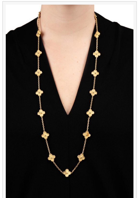
Van Cleef & Arpels vintage Alhambra 18k yellow gold necklace, circa 1990s, featured 20 small textured quatrefoil stations having a small center polished gold sphere VCA ($18,150)

A Stephen Dweck sterling silver, jade, and serpentine multiple strand necklace in the Asian taste, having five strands of smooth and carved jade beads, suspending eight pierce carved serpentine