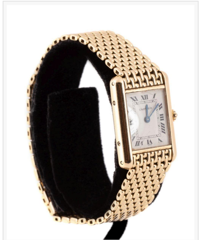
Cartier 18k yellow gold Tank wristwatch, featuring a Swiss made quartz movement, a white dial with black Roman markers, synthetic sapphire crystal, and a wide link bracelet ($10,285).

This press release can be viewed online at: https://www.einpresswire.com/article/673321849