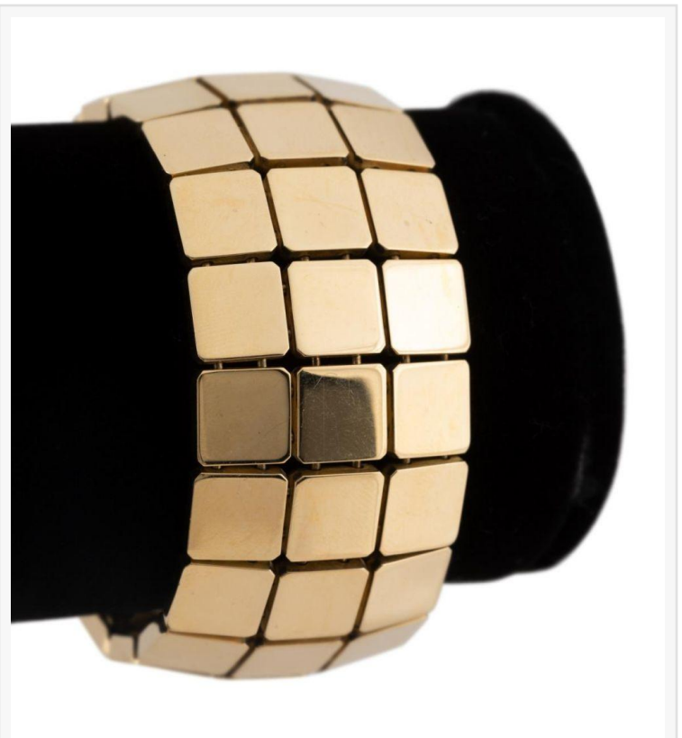
Circa 2002 Tiffany & Co. 18k yellow gold "Tiffany Squares" wide bracelet having three rows of repeating squares with a mirror like finish, in a Tiffany & Company clam shell box ($15,370).

Ahlers & Ogletree is a multi-faceted, family-owned business that spans the antiques, estate sale, wholesale, liquidation, auction and related industries. Ahlers & Ogletree is always seeking quality consignments for future auctions. To consign a single item, an estate or a collection, you may call them directly at 404-869-2478; or, you can send them an e-mail, at consign@AandOauctions.com .