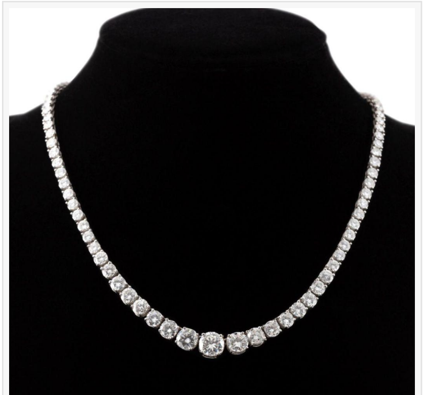
Platinum tested diamond Riviera (or Riverie) necklace boasting one round brilliant cut diamond weighing about 2.20 carats, plus 95 smaller graduated round brilliant cut diamonds ($33,275).

The platinum tested diamond Riviera (or Riverie) necklace was the auction's top lot. It boasted one round brilliant cut diamond weighing about 2.20 carats of VS-2 clarity and I/J color, plus 95 graduated round brilliant cut diamonds of VS-2/SI-1 clarity and H/I color, weighing approximately 24.00 ctw. The diamond clasp contained one marquise cut and six baguette cut diamonds weighing 0.15 ctw.