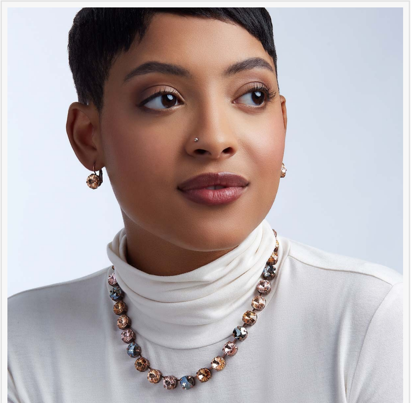
Sabika Winter 2023 Collection