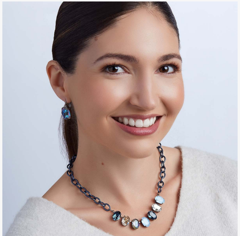
2023 Winter Sabika Collection