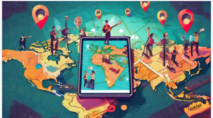
Select & Watch Live Content Directly from the Map