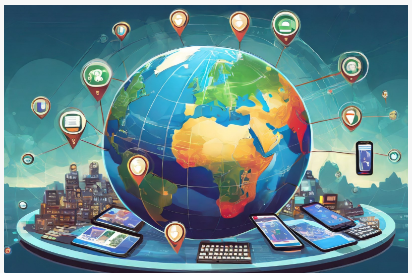
Concept of Locateye

In contrast to traditional live streaming, Locateye stands out for its interactive map interface. Locateye streamers share live video with real-time location on an interactive map. Viewers pick destinations, select streamer pins, and dive into unique and live perspectives instantly. This novel concept eliminates geographical barriers, offering a new dimension to live streaming. Locateye caters to a diverse audience, with a special emphasis on influencers, travel enthusiasts, live artists, and outdoor adventurers. Streamers can unlock new opportunities as they monetize their content, making Locateye the go-to platform for those seeking to share and explore the beauty of the world.