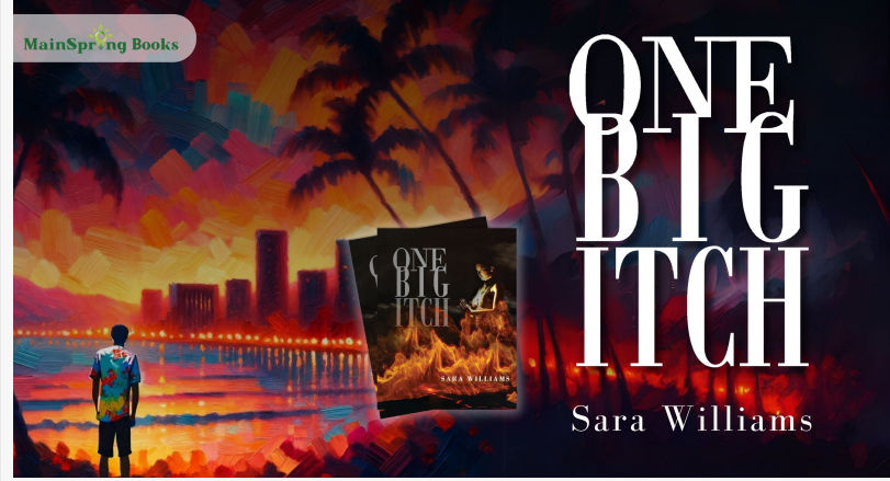
One Big Itch

MainSpring Books Powered By MainSpring Books MainSpring Books CONE