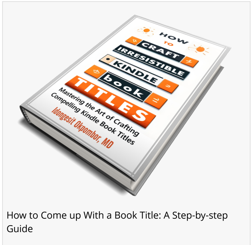
How to Come up With a Book Title: A Step-by-step Guide

/EINPresswire.com/ -- Renowned author Idongesit Okpombor has just released his highly-anticipated latest masterpiece, " How to Craft Irresistible Kindle Book Titles : Mastering the Art of Crafting Compelling Kindle Book Titles." This ebook and paperback are now available on Amazon, ready to teach writers how to come up with a book title, promising them an unprecedented guide to capturing their audience at first glance.