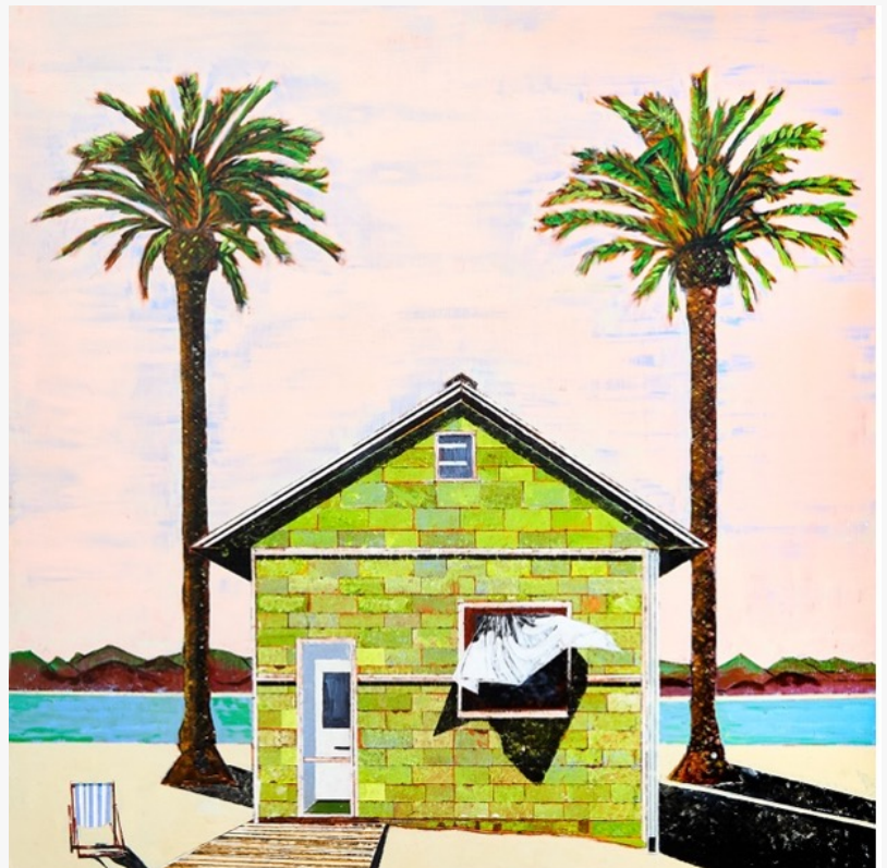
Bungalow #1 by Don Hershman (Acrylic, ink, and pencil on wood - 36"x36")