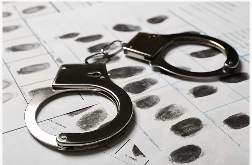
Find Out The Truth About Anyone