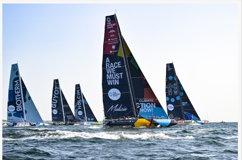
The Ocean Race is leading the race for the ocean.

The Award recognises the efforts of the Racing with Purpose sustainability programme, which was created with Premier Partner, 11th Hour Racing , to put ocean protection at the heart of the round-the-world sailing competition.