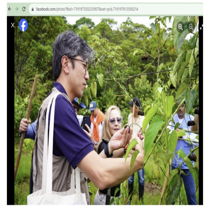
GMS $QEDN signed agreement with Coomultiagrop

KOICA and UNODC invited GMS SACHA INCHI to the opening of the $5.7 Million USD project in Putumayo on October 19, 2023