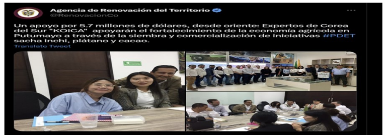
United Nations Koica and GMS Oct 18, 2023