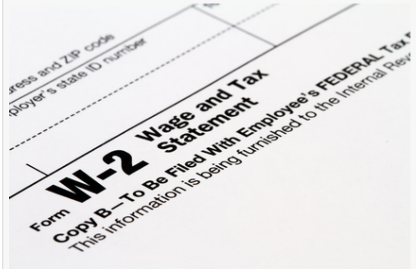
When to Expect W-2 Form