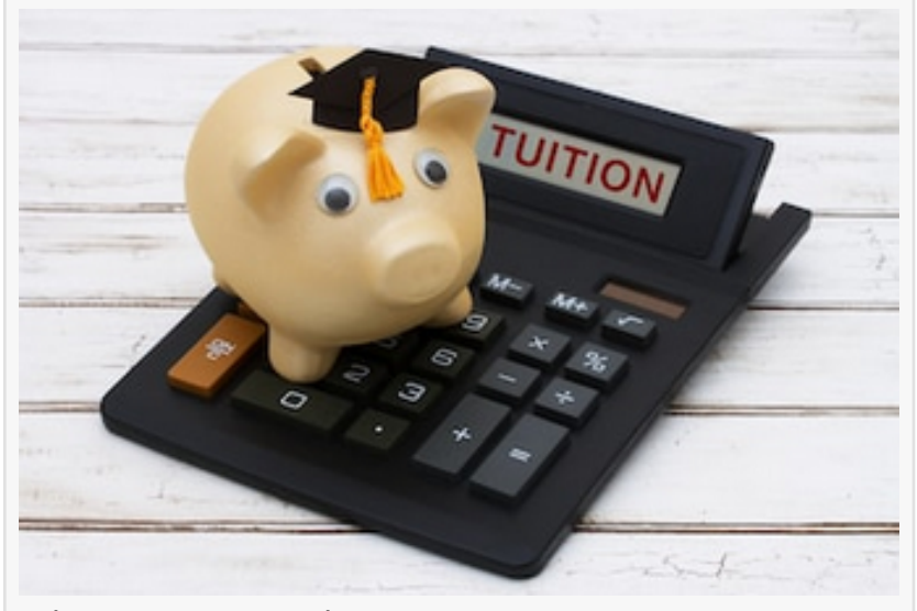
Education Tax Credits

<u>The extension of the American Opportunity Credit</u> will provide much-needed relief to families struggling to afford the rising costs of higher education. With the increasing cost of tuition, textbooks, and other expenses, many families are finding it difficult to pay for college. The credit